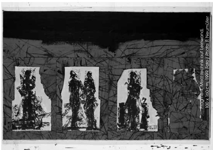
Fragment, Mischtechnik auf Leinwand, 100 x 160 cm, 1999, Foto / Photo: F. Neumüller

Od 9. marca do 15. julija, od 9.00 do 16.00 / From 9 March to 15 July, 9.00 am – 4.00 pm Viteška dvorana / Knight's Hall, Križanke