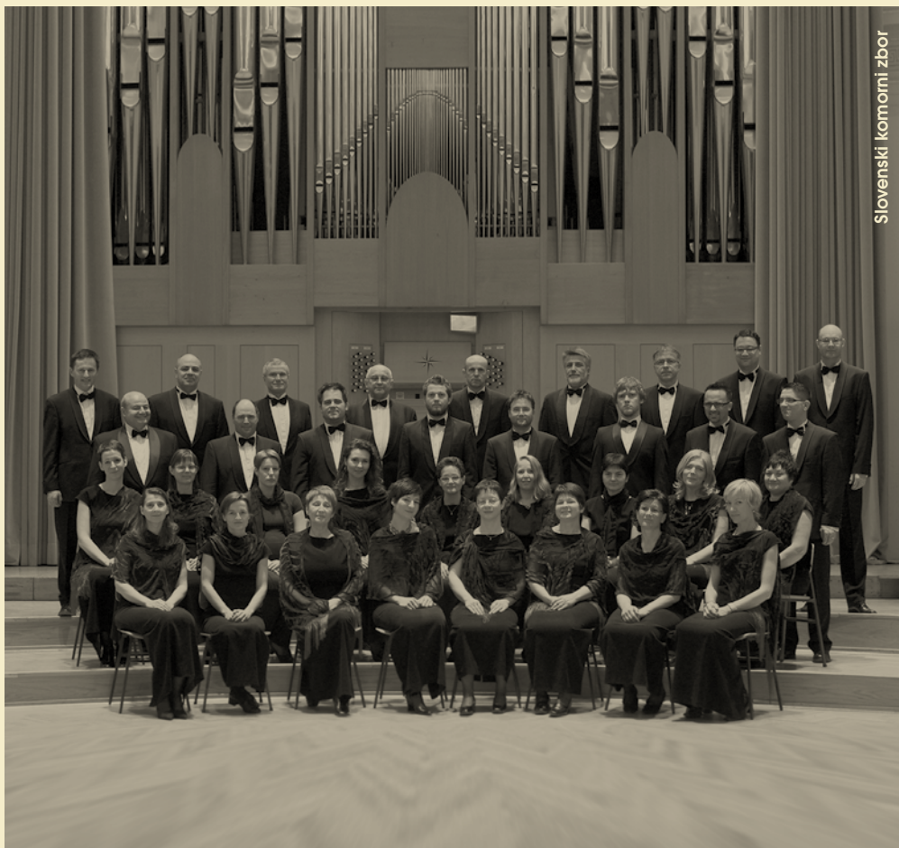
Slovenski komorni zbor

KONCERT OB ODPRTJU 28. SLOVENSKIH GLASBENIH DNI OPENING CONCERT OF THE 28 th SLOVENIAN MUSIC DAYS