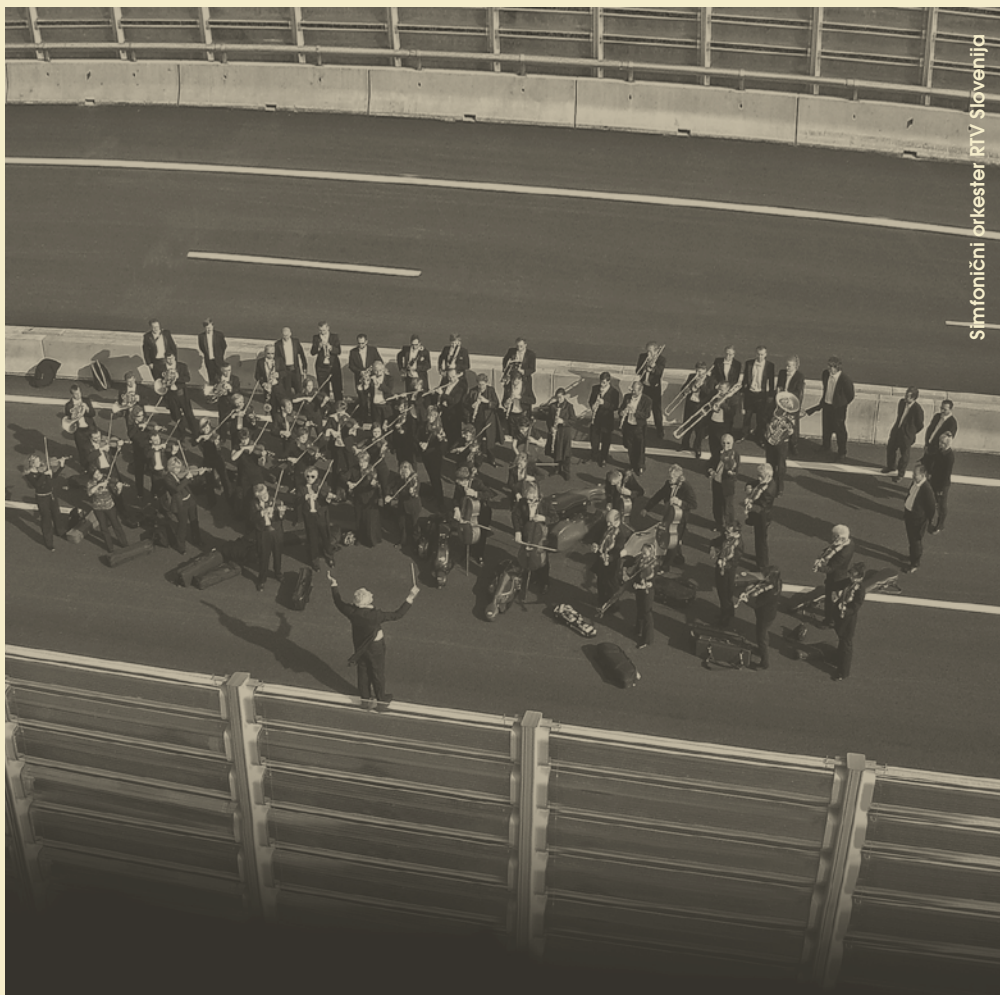
Simfonični orkester RTV Slovenija

SKLEPNI KONCERT 28. SLOVENSKIH GLASBENIH DNI CLOSING CONCERT OF THE 28 th MUSIC DAYS