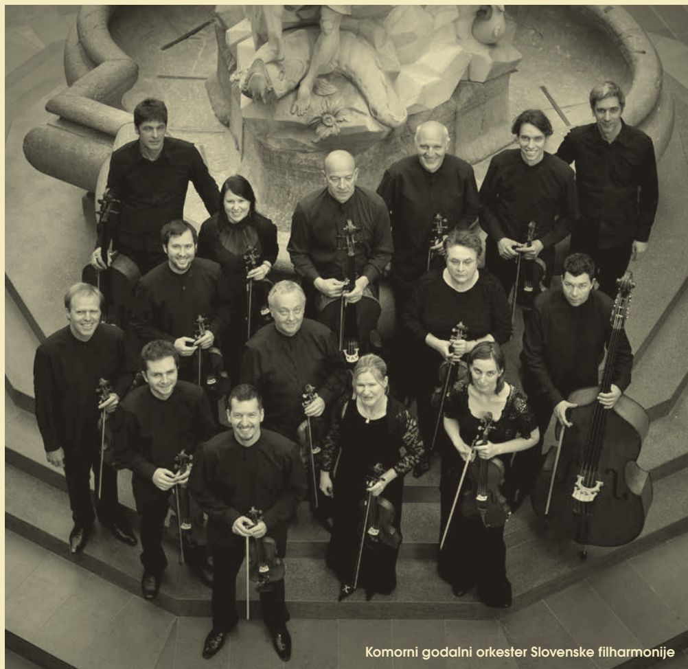
Komorni godalni orkester Slovenske filharmonije