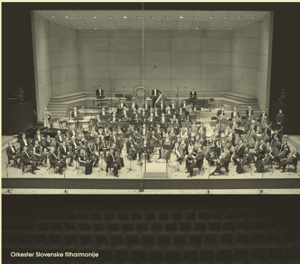
Orkester Slovenske filharmonije

SKLEPNI KONCERT 29. SLOVENSKIH GLASBENIH DNI CLOSING CONCERT OF THE 29 TH SLOVENIAN MUSIC DAYS